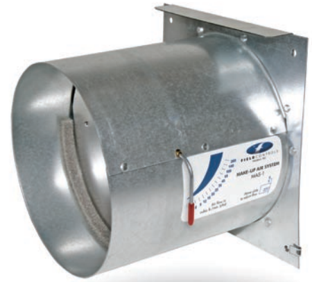
Make-Up Air Control