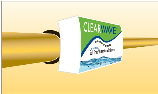
Mount directly to pipe as close to the cold water entry as possible with supplied tie-wraps.

After 1 to 2 months: Any scaly crust or stains in toilets or under faucets should be significantly reduced. No new stains or crust should form. Mold that attaches to scale will begin to disappear from shower curtains and, once cleaned, should not reappear. Depending on the water hardness in the area, the full effects can take up to 12 weeks, especially if the system has been heavily scaled up over many years.