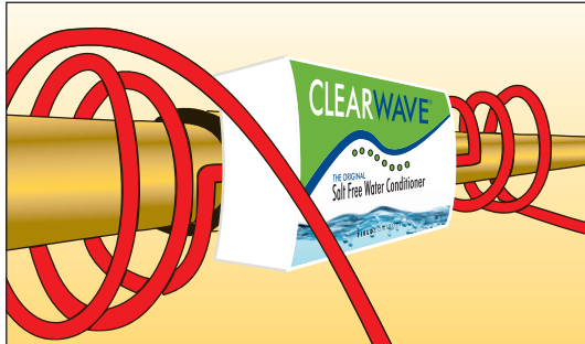
Coil one red antennae counter-clockwise, the other clockwise, and fasten with supplied tie-wraps or electrical tape. The tighter the antenna are coiled, the better ClearWave functions.