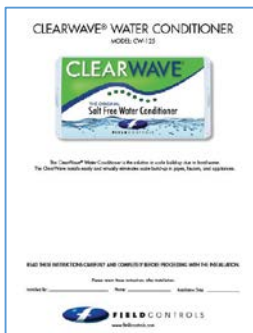
CLEARWAVE OWNER'S MANUAL

REP PORTAL: www.fieldcontrols.com/rep-portal (Rep Portal link is located in footer of website). Pitch cards, price sheets, current promotions and more can be viewed and downloaded from the Rep Portal. Use your MITS username and password to log into the Rep Portal. Username: _____ Password: _____