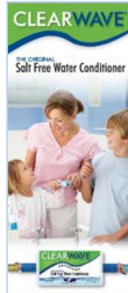
CLEARWAVE CONSUMER BROCHURE: Form 4268 (RS)