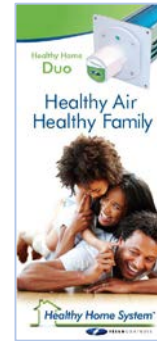
CONSUMER BROCHURE: Form 4384 (GT)