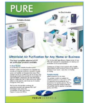
PURE AIR PURIFICATION: Form 4349 RS