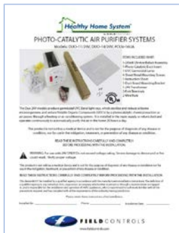
DUO-11/24V, DUO-14/24V & PCUV-16UA MANUAL