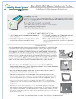
DUO-2000 UVC MANUAL