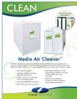
CLEAN SALES SHEET: Form 4348 (RS)