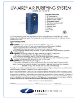
UV-AIRE UV-12 & UV-18 MANUAL

REP PORTAL: www.fieldcontrols.com/rep-portal (Rep Portal link is located in footer of website). Pitch cards, price sheets, current promotions, and more can be viewed and downloaded from the Rep Portal. Use your MITS username and password to log onto the Rep Portal. MITS Username: _____ MITS Password: _____