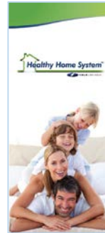
HHS CONSUMER BROCHURE: Form 4312