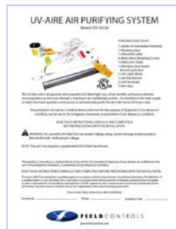
UV-AIRE UV-16/120V MANUAL