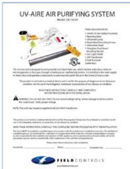
UV-AIRE UV-16/24V MANUAL