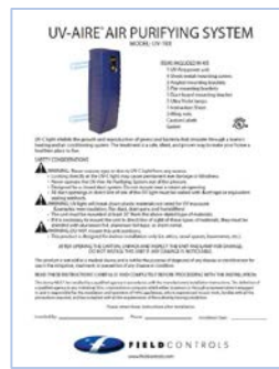
UV-AIRE UV-18X MANUAL