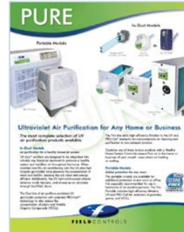
PURE AIR PURIFICATION SALES SHEET: Form 4349 (RS)