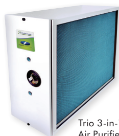
Trio 3-in-1 Air Purifier