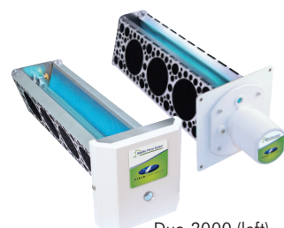
Duo-2000 (left), Duo-16/24V (right) Air Purifiers

UV-Aire® and FlexMountUV® whole house air purifiers feature a powerful UVC germicidal light that purifies the air by neutralizing harmful germs, bacteria, viruses, and mold while irradiating the A-Coil and keeping it clean so the HVAC system lasts longer and runs more efficiently.