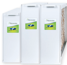
Media Air Cleaner Cabinets