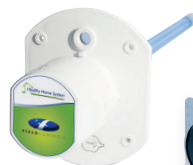
UV-Aire Air Purifiers

Our Media Air Cleaners' high efficiency filters trap particles as small as 1.0 micron and last for up to one year. FlexFilter® makes inventory maintenance easier. FlexFilter replaces over 40 of the most popular filter models including Honeywell and Aprilaire filters.