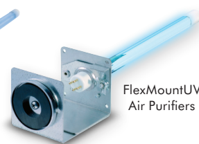
FlexMountUV Air Purifiers