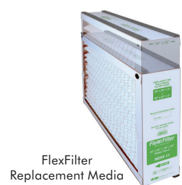
FlexFilter Replacement Media