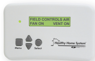
Healthy Home System Control Plus

The Duo whole house air purifier combines AirFresh™ Carbon Odor Adsorption with our patented PRO-Cell™ Technology and UVC germicidal light so indoor air is Pure and Fresh. Our PRO-Cell™ PCO technology removes odors, smoke, and VOCs. The Trio does everything the Duo does plus it features a MERV 13 air cleaner.