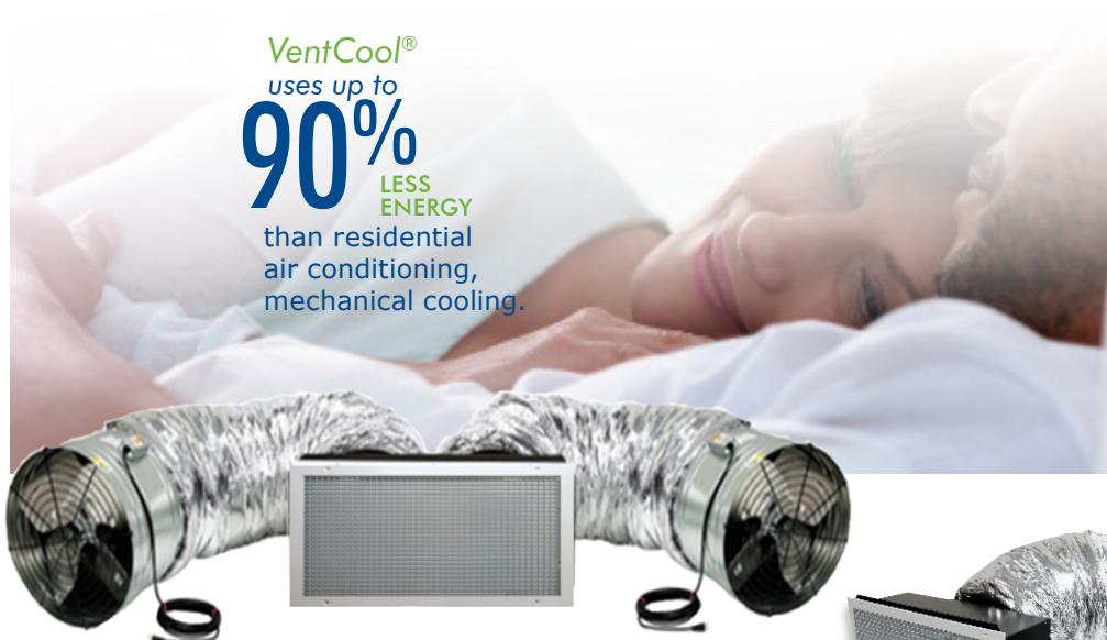
Model S6.5 Dual Fan Design

VentCool® uses up to 90% LESS ENERGY than residential air conditioning, mechanical cooling.