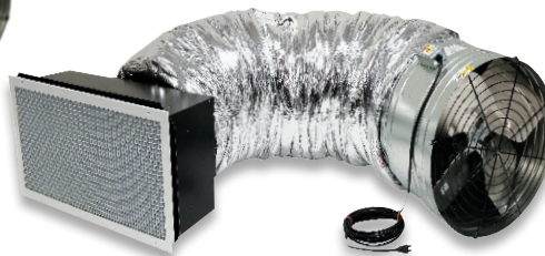
Models S2 thru S5 Single Fan Design