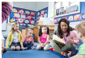
Day Care Facilities