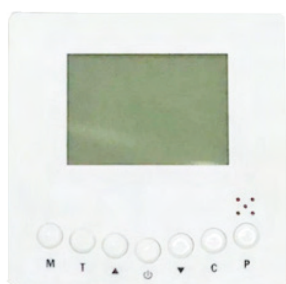
Optional Upgrade: DH1-RCK Remote Control PN: 602609206