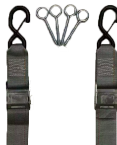
Optional Upgrade: DH2-HK Hanging Kit PN: 602609207