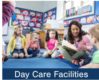
Day Care Facilities