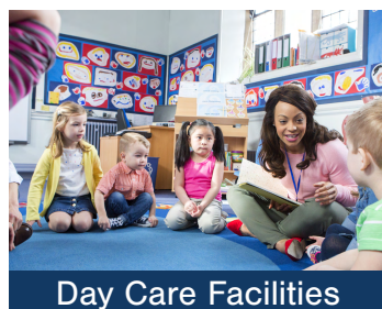
Day Care Facilities